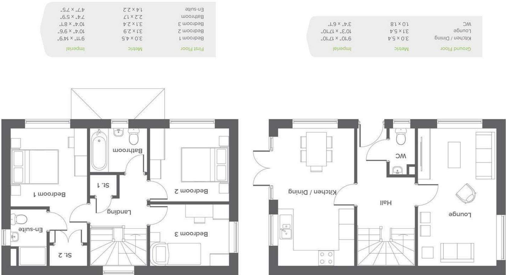
The Sorrel Three-bedroom home

MISREPRESENTATION ACT 1967. Messrs Wright Marshall for themselves and for the vendors or Lessors of this property, whose agents they are, give notice that: 1. The particulars are set out as general outline only for the guidance of intending purchasers, and do not constitute, nor constitute part of, an offer or contract. 2. All descriptions and references to condition and necessary permissions for use and occupation, and other details are given in good faith and are believed to be correct but any intending purchasers or tenants should not rely on them as statements or representations of fact but must satisfy themselves by inspection or otherwise as to the correctness of each of them. 3. No person in the employment of Messrs. Wright Marshall has any authority to make any representation whatever in relation to this property.